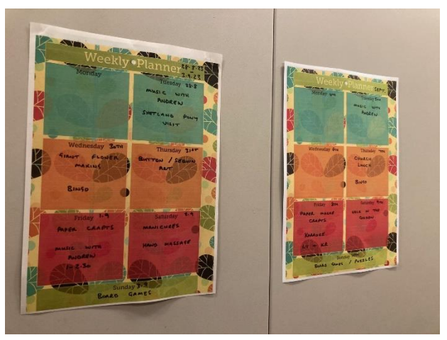
Weekly activity planner on display.