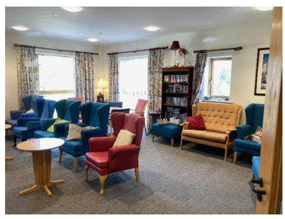
The Communal Lounge in Lansdown View set up for watching TV